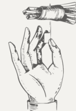
Fig. 5: Serve